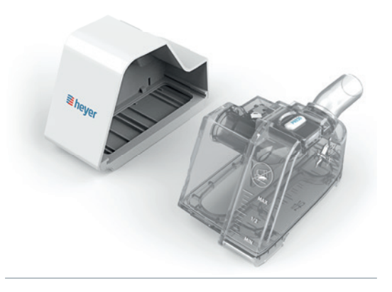
H100 respiratory humidifier